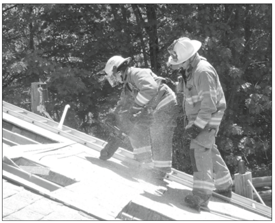
State Fire Instructor Chris Poremby - Instructing Ventilation Practices

While most municipal fire departments look to MFSI for training resources, Graves likes to point out that municipalities can use the professional development opportunities MFSI offers as a retainment and recruiting tool.