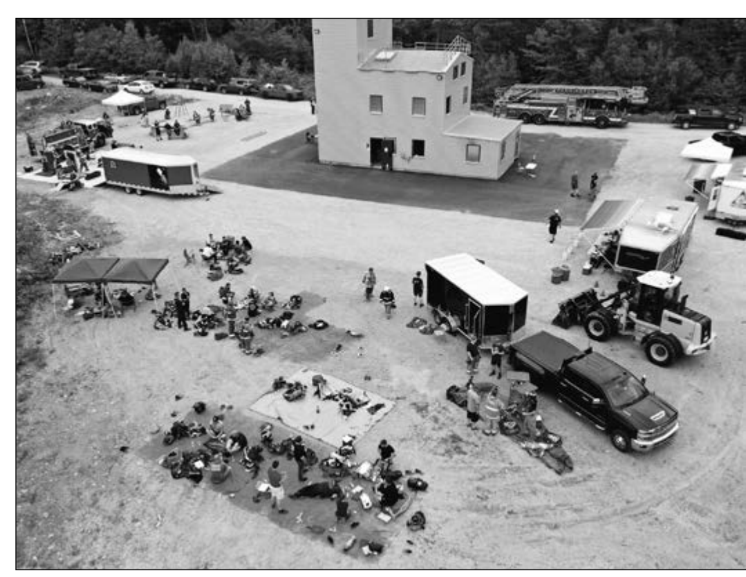
Farmington Fire Training Facility - MFSI Skills Exam 2021 (Submitted photo)

To that end, in addition to professional certifications, MFSI offers a